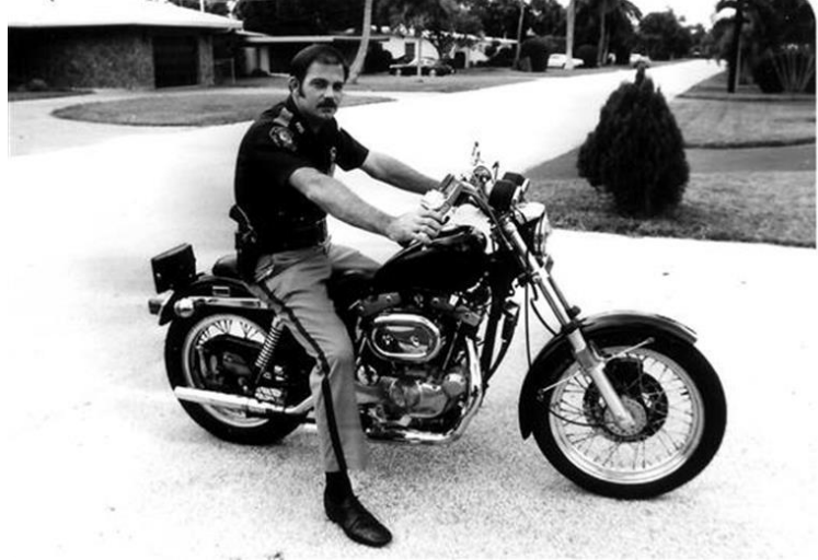
On Tigers 74 Sportster