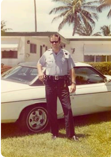
FLPD Reserve 1973